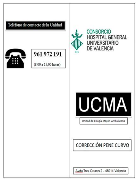
Figure 1A: Explanatory brochure (back cover).

According to the protocol, a detailed history taking and complete physical examination were performed during the first medical visit. Degree of curvature was evaluated with the self-photograph y provided by the patient. Pre-anesthetic assessment was requested and information about the procedure was given. The informed consent was signed in all cases. In addition, a brochure explaining the process was given to the patients (Figures 1A and 1B) which included all preoperative and postoperative instructions as well as a telephone number for assistance if any complications arose.