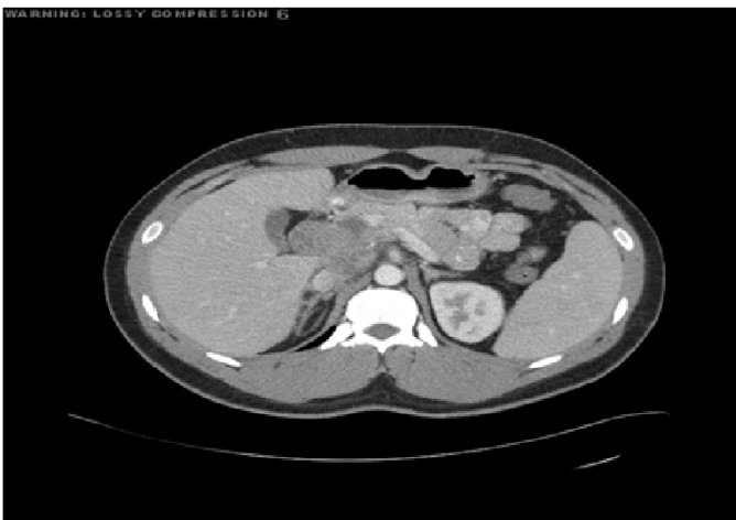
Figure 1: Preoperative CT showing an ill-defined lobulated mass (44 X 59 X 56mm) in the retro and peripancreatic region extending into the hepatic hilum with encasement of the proximal portal vein and hepatic artery in addition to periaortic lymphadenopathy. No dilatation of the biliary tract or pancreatic duct is seen.

Prior to being referred to our general surgery clinic he underwent many diagnostic studies: His blood test—Complete blood count, Basic metabolic panel, Liver function test, Lipase, and Amylase—were all within normal limits. The esophago-gastroduodenoscopy (EGD) showed only a small ulcer in the prepyloric antrum, however, the initial computed tomography (CT) revealed an ill-defined lobulated mass (44 ×59 ×56mm) in the retro and peripancreatic region extending into the hepatic hilum with encasement of the proximal portal vein and hepatic artery without dilatation of the biliary tract or pancreatic duct, and with periaortic lymphadenopathy (Figure 1). Subsequently he underwent CT guided biopsy, which showed reactive lymphoid parenchyma with heterogeneous population of lymphocytes, histiocytes and histiocytic tangles, and some necrotic material. He then underwent Positron emission tomography (PET) which showed a large mass, involving the head of the pancreas, the uncinate process of the pancreas and the caudate lobe of the liver, with standardized uptake value maximum of 13.1 (Figure 2). With these findings, a leading differential diagnosis of pancreatic lymphoma was made and he was referred to our general surgery clinic for definitive tissue biopsy diagnosis, and possible surgical interventions.