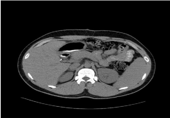
Figure 3: Follow up CT at 5months showed a significant improvement in the pancreatic region

was susceptible to Isoniazid, Rifampin, Ethambutol, and Pyrazinamide. One month after being on all 4 medications, Ethambutol and Pyrazinamide were discontinued. Patient did well with the antitubercular drugs and 5 month follow up CT showed a significant improvement in the pancreatic region (figure 3). The antitubercular therapy was stopped at 6 month, and he was doing well at the one-year follow up.