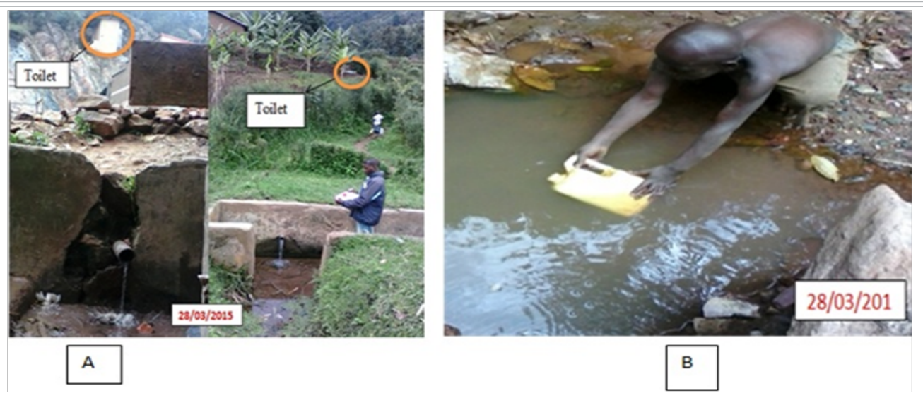
Plate 1A: Water springs and B: Unprotected shallow wells