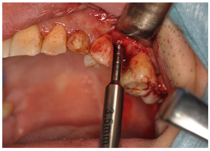
Figure 4: Second sinus lift approach and simultaneous implant placement. Sinus membrane was elevated using the osteotome technique.