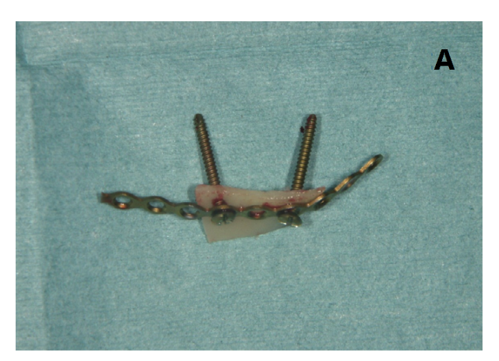
Figure 1: First sinus lift through the lateral approach. A trapezoidal bone window was made in the lateral sinus wall by osteotomy using a piezoelectric device.