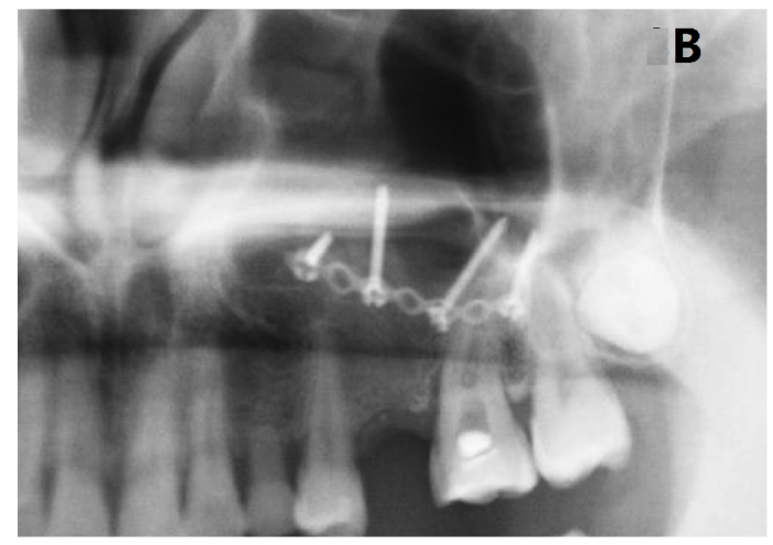
Figure 3: Pre- and postoperative panoramic radiograph. A) Preoperative panoramic radiograph showing severe atrophy of the maxillary ridge in the area of the retained deciduous tooth. B) Postoperative panoramic radiograph finding at 6 months after first sinus lift.