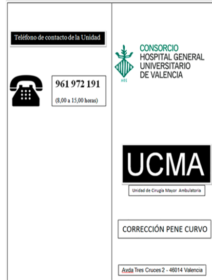
Figure 1A: Explanatory brochure (back cover).

According to the protocol, a detailed history taking and complete physical examination were performed during the first medical visit. Degree of curvature was evaluated with the self-photography provided by the patient. Pre-anesthetic assessment was requested and information about the procedure was given. The informed consent was signed in all cases. In addition, a brochure explaining the process was given to the patients (Figures 1A and 1B) which included all preoperative and postoperative instructions as well as a telephone number for assistance if any complications arose.