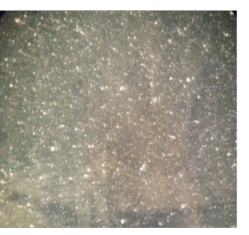
Figure 2: Human islets isolated during the recombination phase of islet isolation. Figure shows direct image of human islets of Langerhans under dissecting microscope. In the isolation process, first, acinar cells were seen as blocks. Following the increase of the number of acinar cells, free islets began to appear and increase.