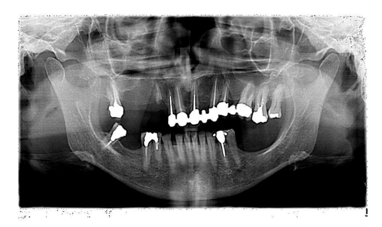
Figure 1: Preoperative panoramic radiograph that shows the edentulous ridges of the jaws. The fourth quadrant needs the placement of two dental implants in position 45 and 46, which one in a post extractive socket in the premolar area.

A 66 year-old woman was referred to the Department of Oral Surgery of the University of Chieti-Pescara, Italy by her doctor for extraction of two premolars in the right mandible and right sinus lift. Her health history was unremarkable. The patient presented at this facility complaining of recurrent infection, tenderness and swelling in the lower right first and second premolars. A clinical examination of the patient revealed a buccal swelling. A panoramic radiograph was taken. The tooth mobility was tested with mild tenderness to percussion (Figure. 1). A periodontal probe was used to examine the pocket depth, revealing a depth of greater than 6 mm on the buccal side. The radiograph showed that the lower right second and first premolars had periapical radiolucency and incomplete root canal treatment. After discussing the options with the patient, she agreed to have the teeth removed and after a healing period of 2 months, two im-plants (Bone System, Milano, Italy) were placed to replace the missing teeth. No problems were reported during the implant placement, but during the positioning of the cover screws, the mesial implant disappeared, and a diffuse hemorrhage was observed that filled the oral cavity.