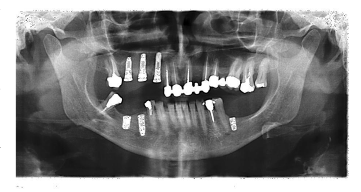
Figure 4: Panoramic radiograph taken at 4 months from the surgery. After the submerged healing, the treated site showed a good osseointegration.

After 4 months of submerged healing (Figure. 4), the implant was exposed. The implant was manually tested for stability by loosening the cover screws. Within one-month, provisional screw-retained reinforced acrylic restoration, rigidly join-ing the implant, was delivered. Four months after delivery of the provisional prosthesis, definitive screw-retained metal-ceramic restoration rigidly joining the implant was delivered. At one week, the prostheses were checked, and the patient was given additional oral hygiene instructions.