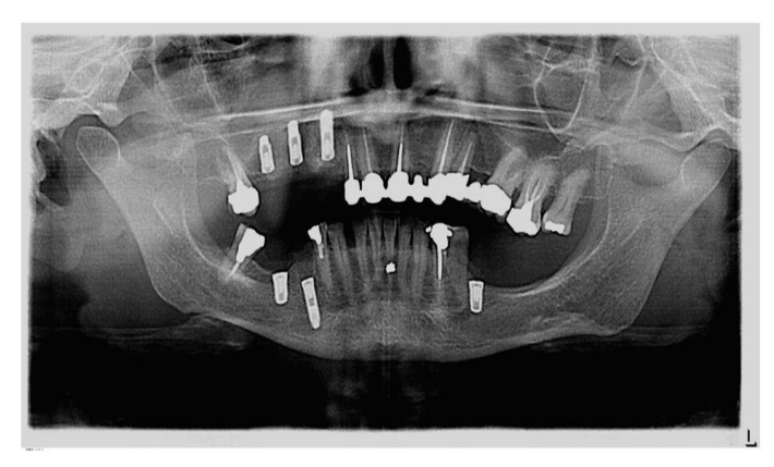
Figure 2: Immediate post-operative radiograph. The panoramic scanning shows an implant location near the mental nerve.

After clinical examination, a panoramic radiograph was taken. The radiograph showed the implant located near the mental nerve (Figure. 2). Before the implant was removed, a CBCT radiograph was taken of the exact location of the implant. The radiograph showed the implant in contact with the mandib-ular inferior border surrounded by a trabecular bone and later-ally to the mental nerve (Figure. 3). The implant was removed by screwdrivers, the implant site was filled with a porcine bone xenograft (Tecnoss, Coazze, Turin, Italy) and the new implant was replaced immediately. Intraoral radiographs (baseline) were made with a paralleling technique to calculate the correct posi-tion for the implant. The patient was seen after 1 week for suture removal and after one month to evaluate together the surgical intervention.