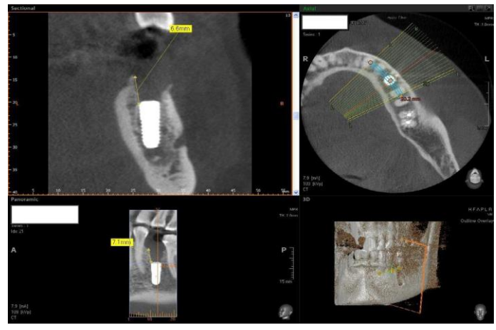
Figure 6: Multiplanar Reconstruction of CBCT scans. The implant appears displaced into the mandibular corpus; a large medullary space was present.

A 52-year-old man was sent to the Oral Surgery Clin-ic at the Department of Oral Surgery of the University of Chi-eti-Pescara, Italy for a first visit for a light pain in the left poste-rior mandible. Intraoral examination revealed a multiple implant placement with a complete rehabilitation with fixed prosthesis. After clinical examination, CBCT showed an implant displaced in the mandibular corpus and located in contact with the mandibular inferior border and laterally with the mental nerve (Figure 6). The coronal portion of the implant was 6 mm under the ridge and in the axis. Removal of the implant from the mandible depth was proposed. The patient refused to undergo this operation and remained asymptomatic for seven months after the migration of the implant. After 6 months the coronal portion of the implant was completely covered by new bone. The submerged healing implant was exposed after the healed bone had been removed with a Piezosurgery Device™ and a healing screw was applied on the coronal portion with many difficulties, but the coronal portion of the implant was not completely exposed. It was not possible to place an abutment at 6 mm under the ridge. After the difficulties of a provisional or definitive crown, the implant was removed by unscrewing and a new implant of 4 × 11 mm (Micerium S.p.A., Avegno, Genova, Italy) was immediately placed. After 4 months a healing screw was applied and the implant was stability.