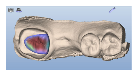
Figure 4: Digital design of inlay restoration using E4D system, occlusal view