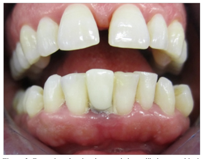
Figure 2: Front view showing the extruded mandibular central incisor