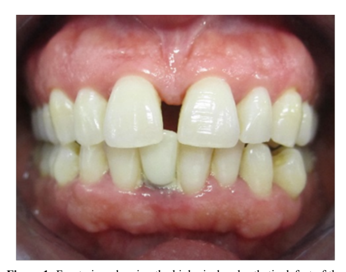
Figure 1: Front view showing the biological and esthetic defect of the fixed restoration

to confirm the desirable position of the MDI in the mesio-distal center of the edentulous space without compromising adjacent teeth. A temporary cap was used to make temporary prosthesis allowing immediate esthetic rehabilitation, and was inserted with clipping (without cementation) which is in favor of tissue healing without compromising periodontal health. The interim crown was kept out of occlusion with minimal interproximal contact. Postoperative instructions were given and appointment was scheduled after 7 days to control the mucosa healing. The patient reported minimal discomfort post operatively. After one month, a definitive impression was made using impression coping (Figure 5,6). This allowed a precise impression work. After the lab analog was placed into the coping, and the cast model was made, the plastic coping was used by the laboratory technician to perform the framework of the future porcelain-fused-to metal crown. Intraoral checking of the framework revealed a perfect marginal adaptation due to the use of the impression coping. After veneering with feldspathic ceramic, and intraoral checking, single crown was glazed, then cemented to the MDI (Figure 7-9). Periodic follow-up visits were scheduled to monitor to MDI, and health of the gum.