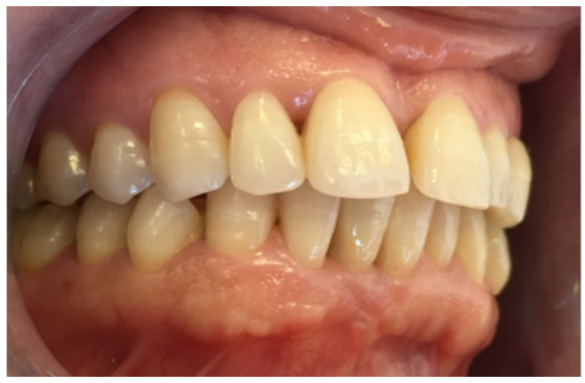
Figure 8: Lateral view showing the alignment of the single-crown mini-implant restoration with adjacent teeth.