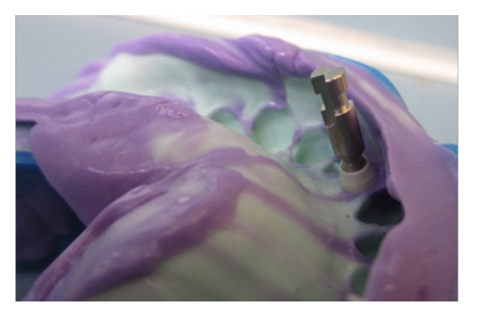
Figure 6: Master impression after analog placement.