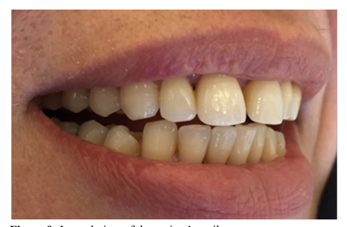
Figure 9: Lateral view of the patient's smile