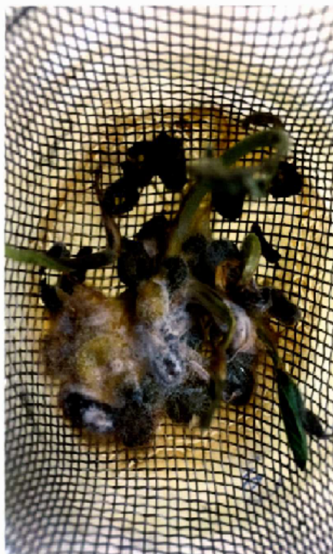
Figure 1: Germinated Mung bean seeds developed in aborted plants in a beaker with tap water (pH 7.3 - 7.5) showing a severe infestation of the cottony fungus, Rhizoctonia solani , which inhibited root, and plant growth.

Of the six beakers containing the Mung bean plants, three showed no noticeable fungal growth; two had moderate fungal growth; whereas one had severe fungal infestation (Figure 1). Figure 2 shows a qualitative comparison of three beakers, selected from the six, containing Mung bean plants two of which with different degrees of fungal infestation. Note that the water level in beaker 1 showed the lowest water level (no fungus detected) to some fungus detected (beaker 2) to seeds showing overt cottony fungus infestation (beaker 3). The last was associated with very little root growth compared to plants in beakers 1 and 2. Note that beaker 1, whose water level was the lowest, showed the greatest root growth, and greater number of grown plants compared to those containing noticeable fungus.