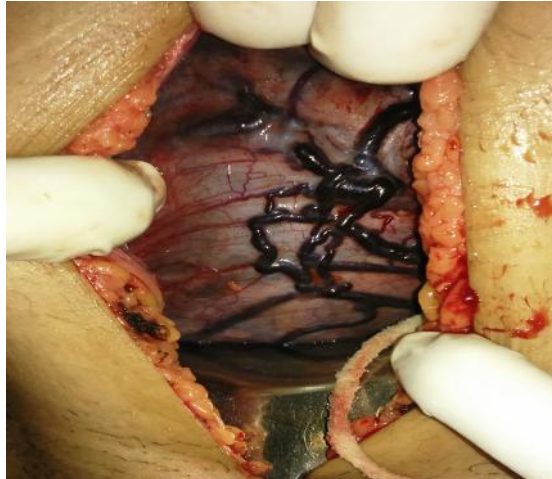
Figure 1: Horrendous picture of rudimentary horn with extensive vessels after giving skin incision.

uterine growth restricted fetus. Infra umbilical midline vertical incision was given on anterior abdominal wall. Intra-operatively, the horrendous picture of abnormal vessels over the uterus was seen (Figure 1). There was a horn of uterus on right side and pregnancy was in left side horn of uterus. She delivered a healthy female neonate weighing 1900 grams. After delivery of the fetus it was found that there was no communication between the cervix and horn of uterus (which was having fetus). Hence a diagnosis of unicornuate uterus with non communicating horn with pregnancy in non communicating horn was confirmed. Additionally, there was abnormal morbid adherence of placenta. Rudimentary horn of uterus with placenta in situ was excised (Figure 2). Subsequently, she had an uneventful recovery. Ultrasound of kidneys revealed no congenital anomaly. Mother and neonate were discharged in healthy condition on day 7 post operatively. Histopathology examination of excised horn of uterus confirmed non communicating horn of uterus with morbid adherent placenta (placenta accreta) (Figure 3). Mother and baby were doing well at 6-week follow-up at the outpatient department.