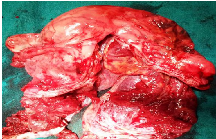
Figure 2: Excised rudimentary horn of uterus with placenta in situ