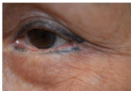
Figure 3: Close up photograph of left eye of same patient 2 weeks after laser treatment.