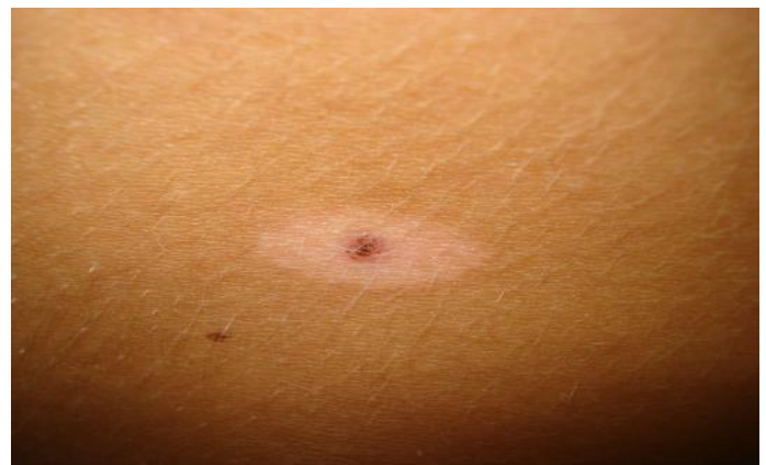
Figure 2: Halo nevus. Clinical image.

A 13 years old boy with congenital melanocytic naevus that was referred to dermatology presented a recent white patch around one naevus. Clinical evaluation revealed a whitish rim around an congenital melanocytic nevus from the lumbar area, without cutaneous induration, resembling a halo nevus (Figure 2).