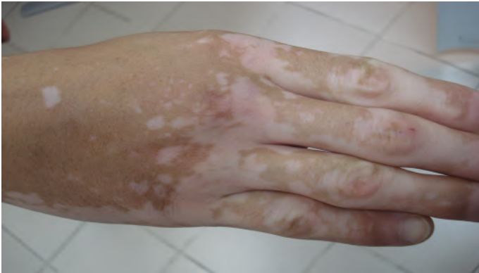
Figure 1: Vitiligo of the hand.

ance of the conditions was HN, vitiligo and thyroiditis. Vitiligo features were in all cases of type non-segmental with bilateral hypo-chromic, symmetrical small macules (0.3 - 0.8 cm diameter) and Koebner phenomena or large plaques located on extremities (Figure 1).