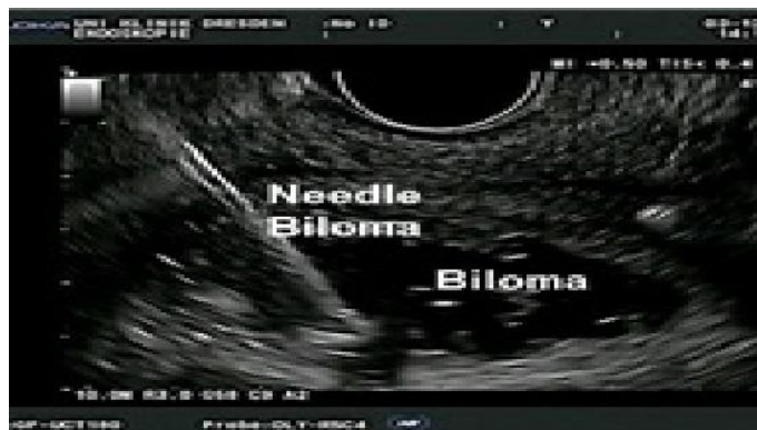
Figure 3: Endoscopic ultrasound-guided puncture. The needle is inside the bilioma.