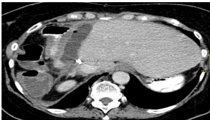
Figure 1: CT scan showing the bile leakage in close proximity to the stomach.