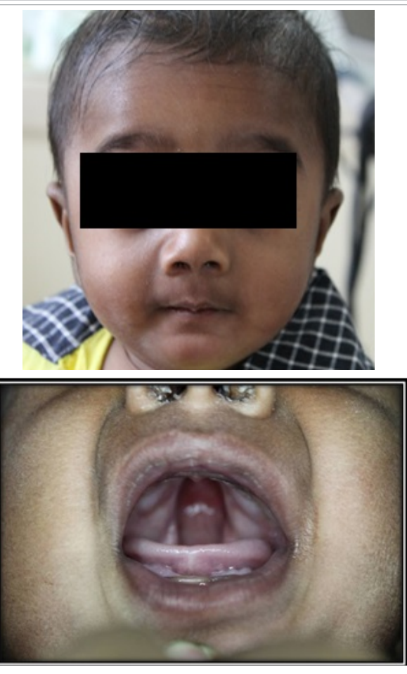
Figure-1: Pre treatment extra oral and intra oral photographs showing cleft palate only.