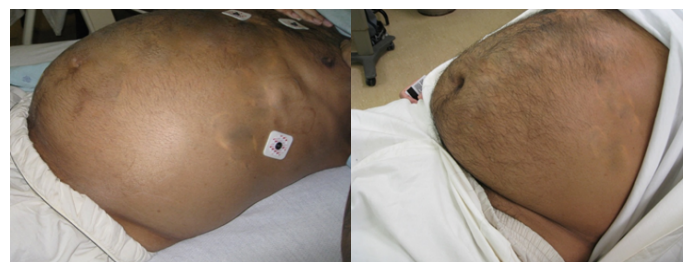
Figure 1: Physical examination of the abdomen before and after Imatinib

Before Imatinib (left): Large tense distended abdomen, seen on initial presentation