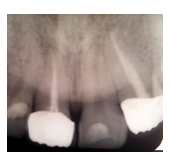
Figure 11: Radiographic reevaluation, after cementation, showing the marginal fit and the quality of the root fillings