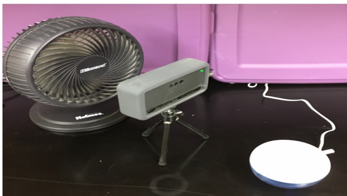
Figure 1: The composite Feng Shui (Wind-Water) apparatus consists of three components. Left to right, a small fan, commercial ion generator and a mister that sprays water into the local atmosphere.

To measure the levels of negative ions emitted at various distances from the composite system we used an ion counter (Model AIC2 Alpha Lab Inc, USA) which measured negative and positive ion levels up to 2000 \times 10^3 ions/cm 3 .